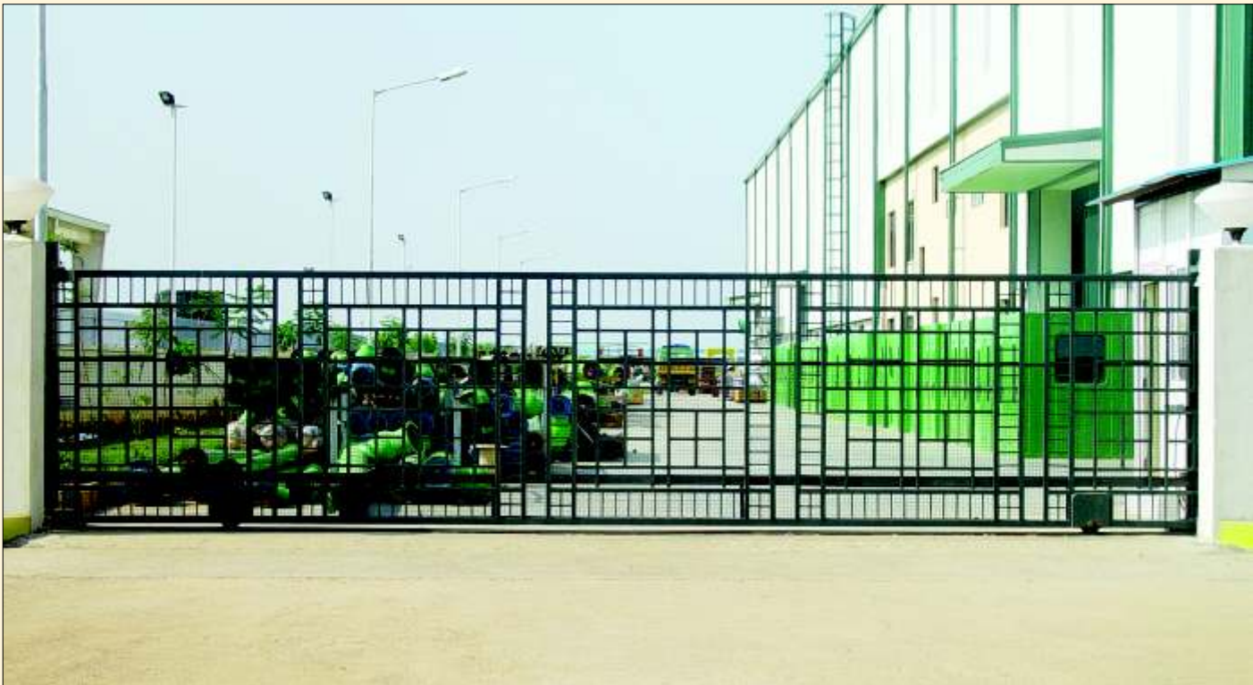
MC MG - 1043