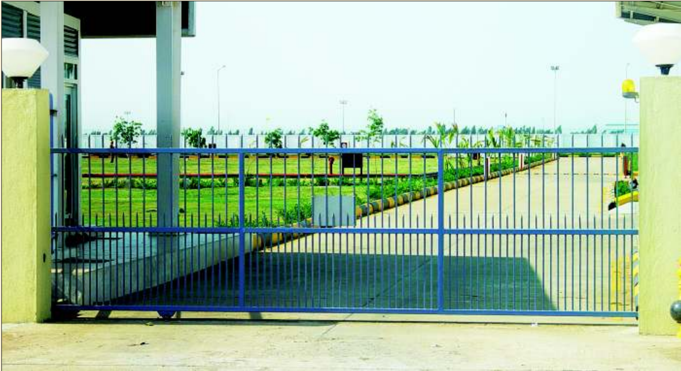
MC MG -1042