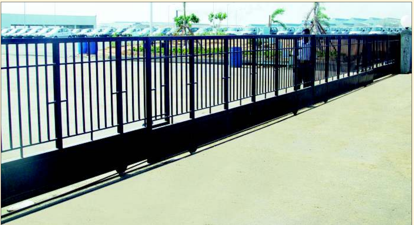
MC MG - 1045