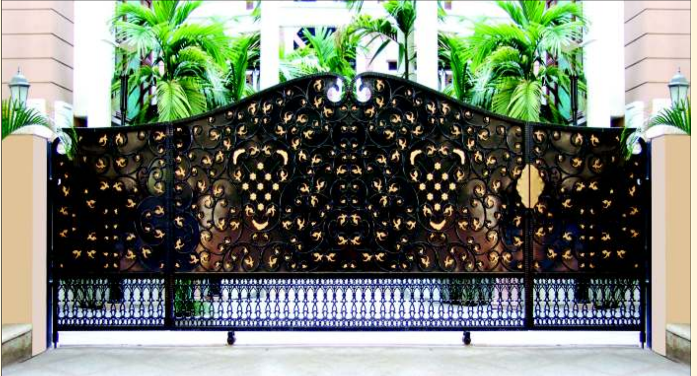
MC MG - 1040