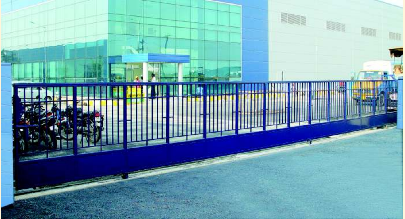
MC MG - 1044